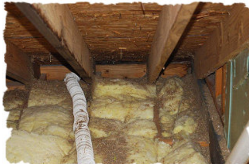
Roof Membrane Failure