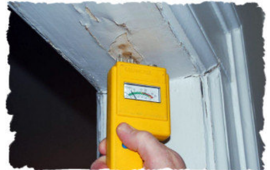
Moisture Meter Testing