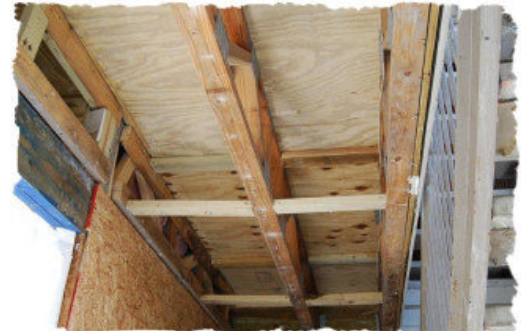
Bracing and Blocking