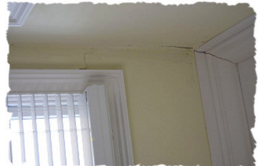
Settling and Water Intrusion