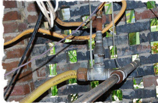
Connections and Modifications