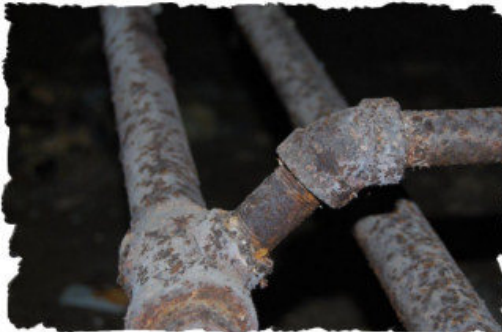
Improper Cleaning for Asbestos