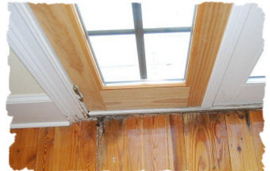
Improper Flashing & No Drain Pan Under Door