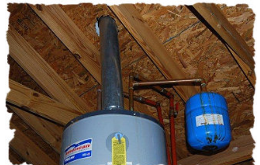
Missing Roof Vent Allows Water Intrusion