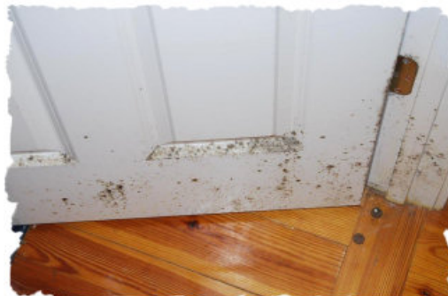
Mold From Crawl Space